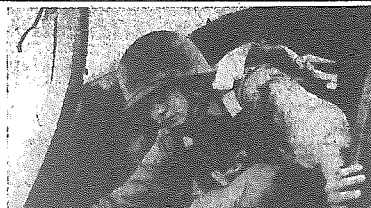
GERONIMO WITH A WOOF WOOF—Man and beast get set for a jump as American Air Corps demonstrate their battle technique at Alliance, Neb., air base. Here Geronimo, shepherd dog named for the parachutists' famed cry, looks before leaping with his pack of first aid supplies and Red Cross blanket.

NEW YORK.—Alice, the 57-year-old Indian elephant which left Coney Island and became queen of the Bronx Zoo elephant house, is dead.