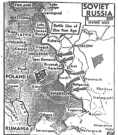
RUSSIAN FRONT—NOW AND A YEAR AGO—The Red Army has advanced from Spa Demensk (arrows) toward Smolensk and Bryansk, Moscow reported.