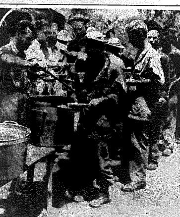
PASS THE AMMUNITION—If an army travels on its stomach, these U. S. soldiers are getting the proper ammunition. It's dinner time at American base in Buna area of New Guinea, and the line is long and hungry.

SAY SURRENDER ASKED (The Italian High Command, in a communique recorded by the Associated Press from broadcasts said the Allies had served an ultimatum for surrender of Lampedusa, as they did at Pantelleria, but declaring the garrison is "heroically resisting.")