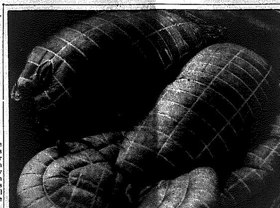
BUILDING BARRAGE BALLOONS TO GUARD AMERICA—Because barrage balloons have proved their worth in skies over old England, workers in New England are busy making the bulky bags for protection of American cities. Note size of men and women giving these partially-inflated balloons an inspection.

WASHINGTON (AP)—The Navy announced today that United States Army bombers have again blasted Japanese runways and installations at Kiska in the Aleutian Islands.