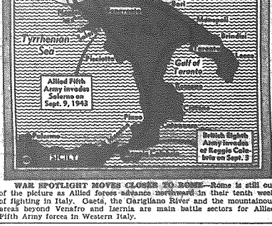
WAR SPOTLIGHT MOVES CLOSE TO ROME—Rome is still out of the picture as Allied forces advance westward in their tenth week of fighting in Italy. Caserta, the Garigliano River and the mountainous hills beyond Venafro and Ischia are main battle sectors for Allied Fifth Army forces in Western Italy.