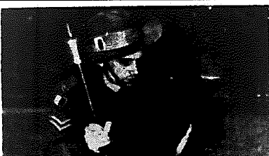
AMONG HIS SOUVENIRS—An Australian soldier looks over equipment used by Jap invaders of Milne Bay.

GEN. MACARTHUR'S HEADQUARTERS, Australia (AP)—Aggressive Allied patrols, fighting in driving rain and aided for the first time by artillery, have forced the Japanese to withdraw from some of their advance positions in the Owen Stanley Mountains north of Port Moresby.