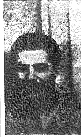
Stalin and Willkie

Next Summer Might Be Too Late, Statement of Willkie Says