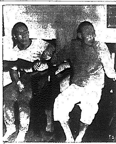
JAP PRISONERS—Two Jap airmen, shot down during attacks on Manila last December, are pictured in this U. S. Army Signal Corps picture just received via Australia.

By ASSOCIATED PRESS—Russia's armies, pressing a relentless spring offensive against the German armies of Winter, were reported battering heavily at key German bases along the entire front today while the Nazi High Command claimed aerial successes and the destruction of 180 Soviet tanks between March 23 and March 30.