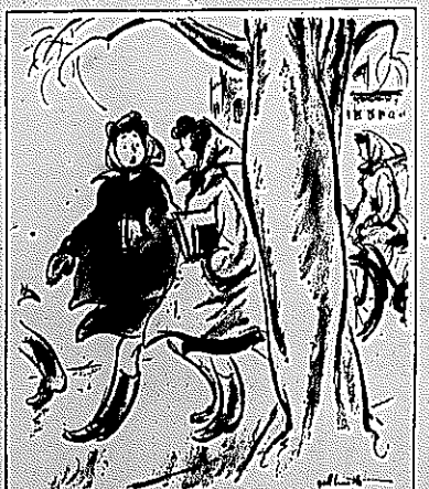
It's awfully hard to decide which one to marry—one of them is terribly handsome and clever, but the homely one lets me do all the talking!