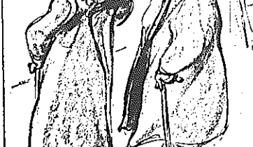
I know you always said from the beginning the automobile would never replace the horse—but it's taken 40 years and a lot of Japs to make you a prophet!

Face in the depths and quiet halls of War and Navy offices, where the real battles are being fought, there is no room for the American who can see this war as a mere game of strategy, complexity, and confusion. Each day the actual, living danger rises on the horizon like the red-ball sun of a summer's day, and one may see the long years ahead before the tide of our American security could again be brought to a standstill.