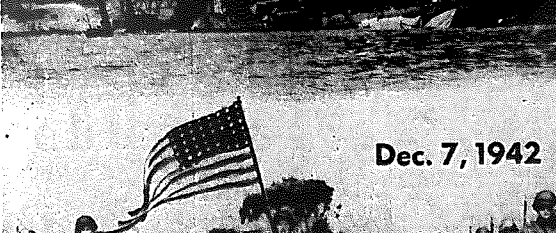
Dec. 7, 1942

AN END—AND A BEGINNING are marked by this first anniversary of the Japanese attack on Pearl Harbor. One year of war has passed—a year in which the United States met many reverses, achieved a few major victories. On the home front have come rationing, bond sales, mighty production efforts. Above all else, the anniversary sees the tide turning, the United States and her Allies taking the offensive, the Nazi might on the wane. Ahead lie long months of war, with its heartbreak, deprivations and misery. But ahead, too, lies certain victory.