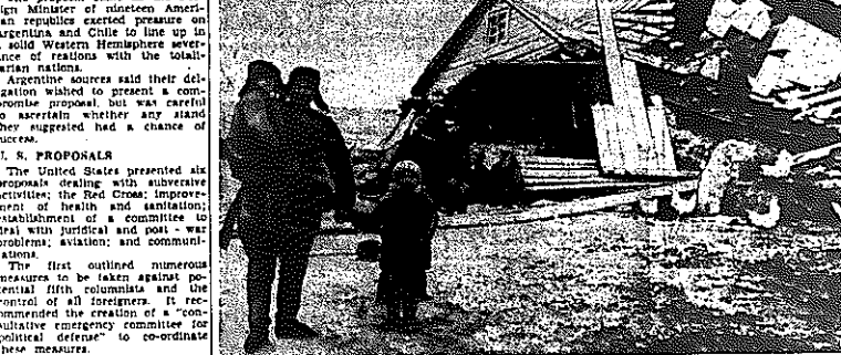
A Russian peasant family returns to what was once their home, after Soviet troops chased the Germans out of their village—see score in the Moscow area recognized in the retreating Soviet counter attack. At right of photo, soldier climbs up to examine wreckage of the house. Behind the group in the foreground, another is apparently helping an old woman to her feet.