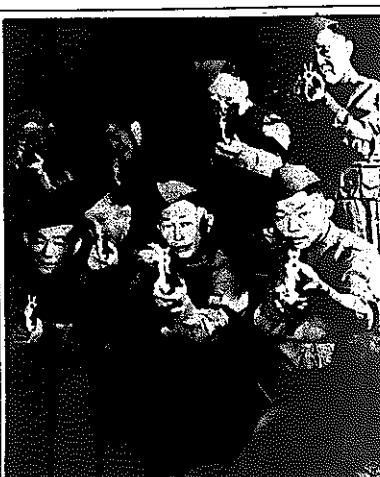
JAP HATERS — This tough visaged group of Koreans, known as the world's champion Jap haters, would like nothing better than to line up some Nippies in their gun sights. They are some of 100 Koreans drilling under supervision of California State guard at Los Angeles.

Pan-American Conference at Rio De Janeiro Expected To Take Staunch Stand Against Axis RIO DE JANEIRO.—The Pan-American Conference convening here tomorrow will be the first in its history to take a stand against war. It also is going to be the toughest and the most important Pan-American conference yet postponed during the first World War.