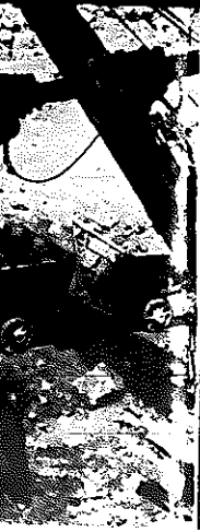
which will be purified raw aluminum.