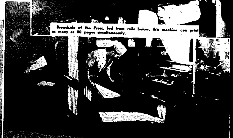
The Big Press: Which prints papers at the rate of 34,000 an hour, whence they are conveyed in an endless flow to the mailing and carriers' room.