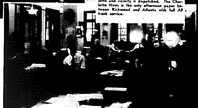
The City Room: Where reporters write their stories, where telegraph copy is edited and headed, and where the quantity and display of news is ordered.

Some of the departments of The Charlotte News, each of which contributes to the emergence of the paper, are here spread out for your view.