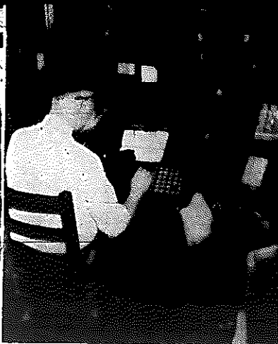
Linotype: One of a battery of twelve which converts copy into type slugs. This machine sets headlines only.