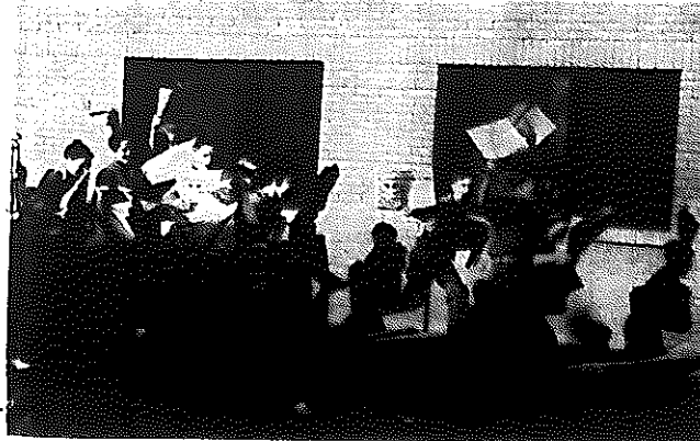
Hot Off the Griddle: Street sales boys dashing to their boats.