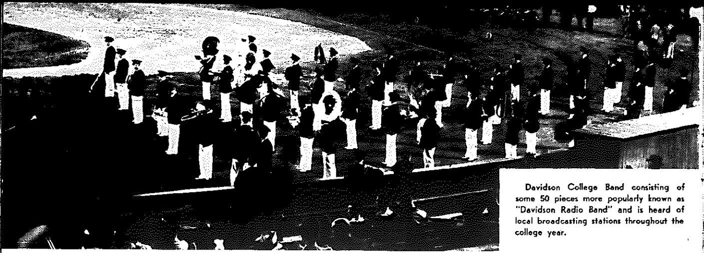
Davidson College Band consisting of some 50 pieces more popularly known as "Davidson Radio Band" and is heard of local broadcasting stations throughout the college year.