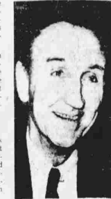
SEN. MIKE MANSFIELD Only One Question Remains

It is also true that the question of a united Germany, under whatever conditions, could hardly be dealt with without bringing up the whole European position, which it would deeply affect. We are certain to be hearing about some daring proposals in this direction.