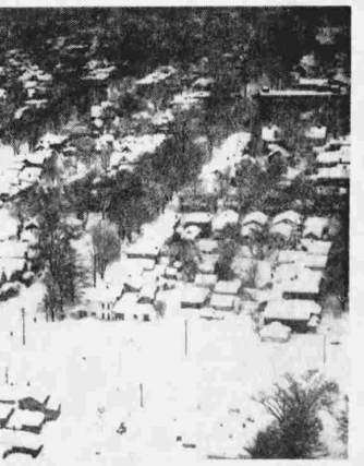
Aerial View Shows Four-Foot Snow Blanket On Oswego, N. Y.