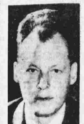
WILLY BRANDT West Berlin Mayor

He has just finished trying to help out, in the same way, but on a smaller scale, at Quemoy. Surrender there would have produced the same sort of results in the Far East as the surrender at Berlin would have produced in the world.