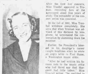
MARGARET TRUMAN Couldn't Hear Self