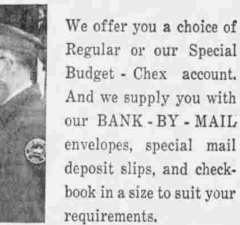
Then He Brings You Deposit Receipt

Actually, the postman makes the trip to the bank for you, and your deposit is credited to your account as promptly as if you yourself had brought it in. Then the postman brings you your deposit receipt. Nothing could be easier or safer than doing your banking by mail the CITIZENS BANK way.