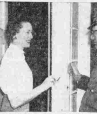
The Postman Picks Up Your Deposit

BUSY HOMEMAKERS and professional men and women have learned what a time-saver it is for them. And it's so simple, so convenient.