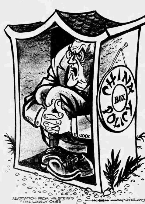
ADAPTATION FROM WM. STEIG'S 'THE LONELY ONES'