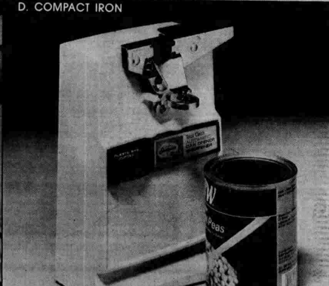
F. CAN OPENER

A. Munsey's Belgian Waffler makes golden brown, 8" square waffles with thick 1" indentations that hold more syrup and toppings. While supplies last, receive a 20 oz. box of Belgian waffle mix with your purchase. Reg. 32.00, sale 20.00*