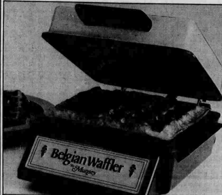
A. BELGIAN WAFFLER WITH BONUS