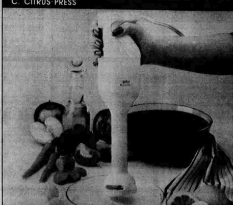
E. PORTABLE MIXER-BLENDER