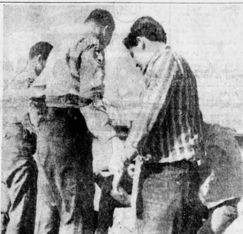
Florida Police Bring Teen-Age Texas "Pirates" Ashore From Yacht.

The counterpart fund arrangement for congressmen was described as working like this: Legation overseas can sign for counterpart funds but do not have to report how they spend it, as executive branch officers do. Their nonitemized receipts go to the State Department. They are accountable only to their committees for how they spend the money, and practices vary from committee to committee.