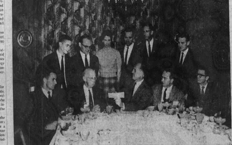
Interinstitutional Affiliation Committee

The Escuela Normal Superior, Mexico City, Mexico.