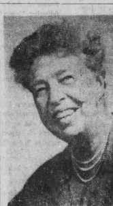
MRS. ELEANOR ROOSEVELT