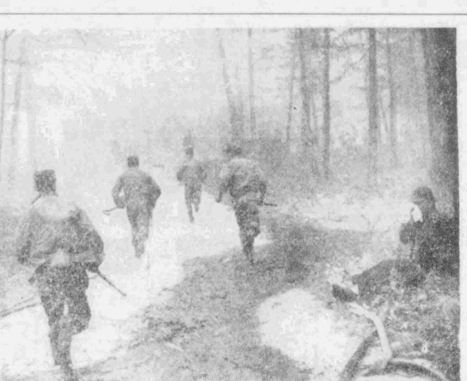
FIRE IS THE ENEMY as these soldiers charge into battle with trenching shovels near Plymouth, Mass. The soldier at right was momentarily overcome by smoke.