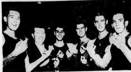
IT'S THE OTHERS WHO NEED THE LUCK