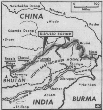
BATTLE AREA, SHADED ALONG INDIA'S BORDER. Action Occurring in Underlined Regions

He said India is facing a "powerful and unscrupulous opponent."