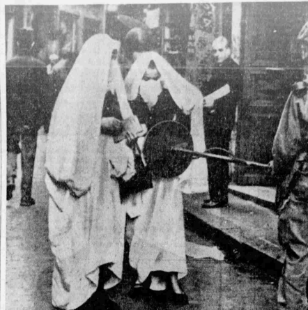
ALGIERS—Respecting Moslem hands-off policy toward women, French soldier uses electronic mine detector to check two veiled Arab women for hidden arms during series of raids in Algiers' Casbah. Seeking Algerian nationalist terrorists, police and troops set up checkpoints throughout native quarter and stopped thousands of residents for identification. Police said a quantity of arms and ammunition was seized.