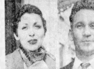
By DICK BAYER

Readers are invited to submit questions for use in this column. The News will pay $3 for every question used.