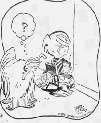
"I'm not talkin' until I see my lawyer. THAT'S what I shoulda said!"