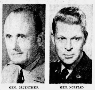
GEN. GRUENTHER GEN. NORSTAD