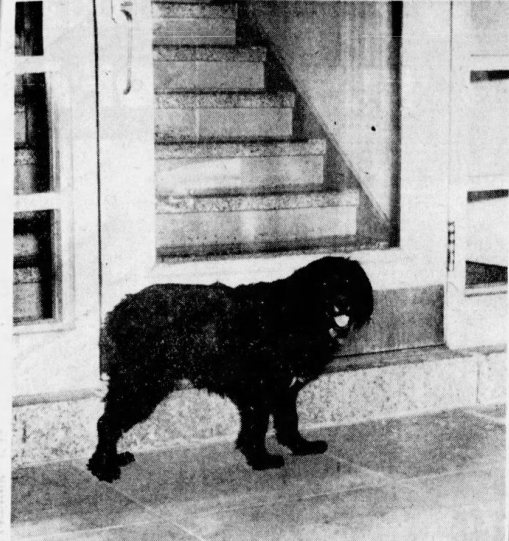
A SHAGGY DOG STORY turned up in Syracuse, N. Y., when nurses became aware that Shaggy had been waiting day after day outside St. Joseph's Hospital. No one knows who Shaggy has been waiting for since she arrived on the steps Friday the 13th. She always seems disappointed when a visitor arrives and it's not the someone she wants.