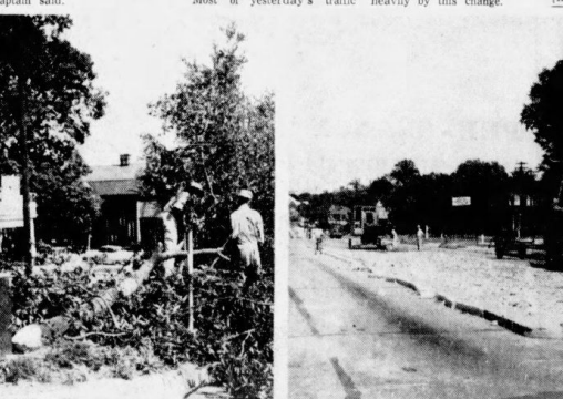
SO THE WORK CAN BEGIN

MR. AVERAGE WORKER doesn't get the protection he deserves in North Carolina's "woefully inadequate" Workmen's Compensation Act, say the editors. For an editorial page discussion of the problem, turn to page 6-A. BEAUTY AFTER FORTY, a new column on The News' women's page, is gaining popularity daily. Today it contains a report on old and new fashions. Turn to page 15-A.