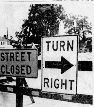
THE STORY IN A NUTSHELL