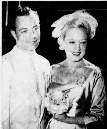
SALLY RAND AND GROOM