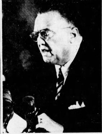
FBI'S J. EDGAR HOOVER He Opposed Outlawing Reds Now

It was picked up at the base post office a half hour before the robbery.