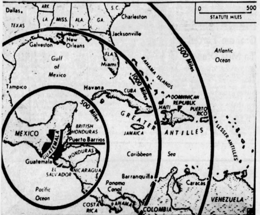
Map shows distance of Guatemala from United States.

By SAM SUMMERLIN TEGUCIGALPA, Honduras—(AP)—Two strategic Guatemalan seaports were reported in the hands of invading anti-Communist "liberation army" forces today.