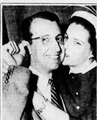
One Of These Men Will Be Pennsylvania's Next Governor

"He is a little better, but is still feeling terrible," his wife told newsmen. Hardy, partner of Stan Laurel in the famous screen comedy team, had to discontinue an engagement at a Plymouth theater.