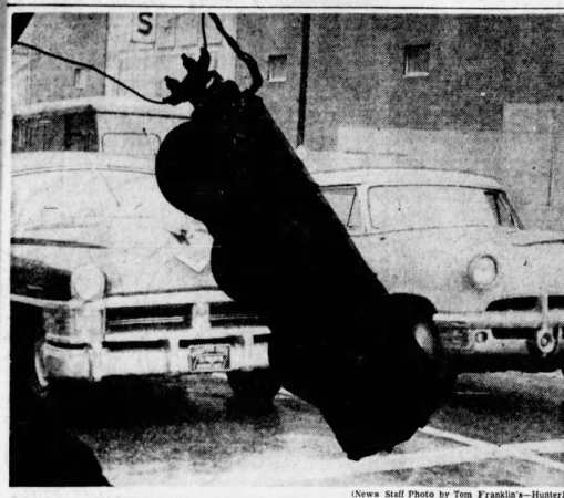
Too Many Cars Are Plowing Through The Red Light