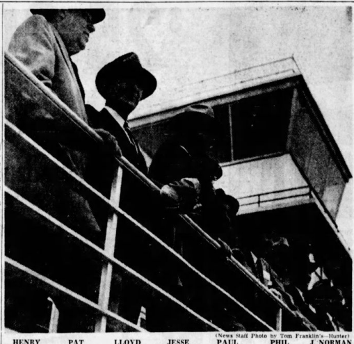
NEW YORK (AP)—The reception committee, looking for a silver lining in the dull clouds.