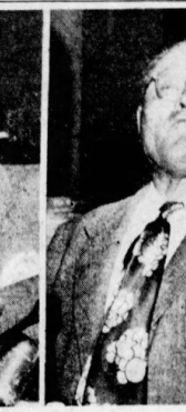
Adjusting His Glasses