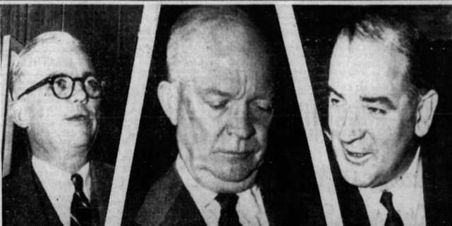
Secretary Stevens President Eisenhower Senator McCarthy

PANCAKES DELIVERED IN A HURRY Housewives of Olney, England, break away from the starting line in the International Pancake Race held every Shrove Tuesday for the past 400 years.