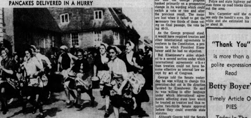
Housewives of Olney, England, break away from the starting line in the International Pancake Race held every Shrove Tuesday for the past 400 years.

At the George proposal stood, it would have required treaties and other international agreements to conform to the Constitution, a provision to which President Eisenhower said he had no objection.