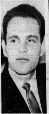
SEN. JOSEPH MCCARTHY Made Accusations