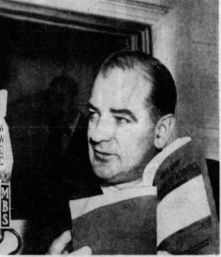
FULTON LEWIS JR. He Had A Guest