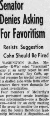
ROY COHN Got Dander Up