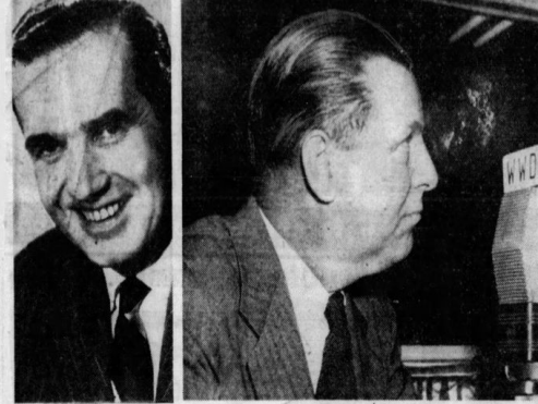
EDWARD R. MURROW Accused Of Lying?