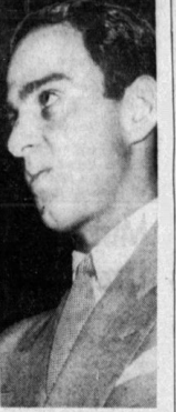
G. DAVID SCHINE No Commission