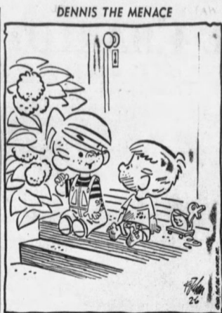
"You look hungry. Why don't you ask your mom for two peanut butter sandwiches?"

BOBBY SOX "Taffy's going steady with one of our first-string basketball stars!"