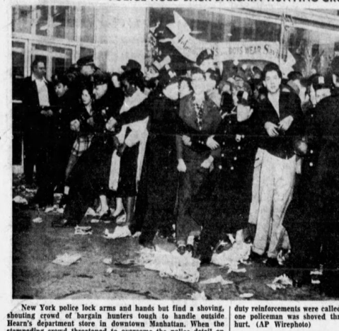
New York police lock arms and hands but find a shoving, shouting crowd of bargain hunters tough to handle outside Hearst's department store in downtown Manhattan. When the stampeding crowd threatened to overcome the police detail on duty reinforcements were called. Women lost hats and shoes and one policeman was shoved through a glass door. He was hurt.