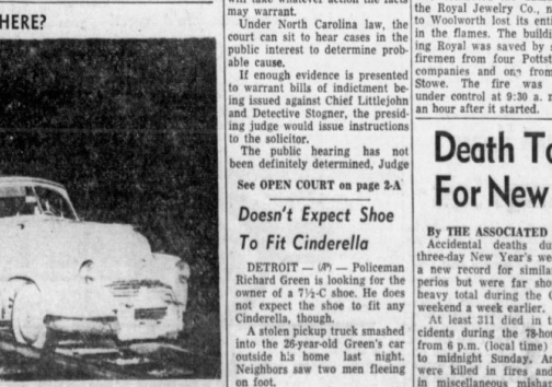
Seaboard Airline Railroad trainmen and police examine an abandoned automobile found stuck in a switch more than a quarter mile from the nearest road on the railroad's main line into St. Petersburg, Fla. Unable to get a wrecker to the scene, trainmen dragged the car back to a crossing by hitching a chain onto the locomotive.