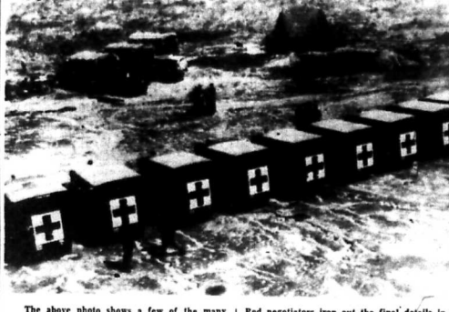
The above photo shows a few of the many field ambulances on UN moment's notice to evacuate UN sick and wounded when UN and Red negotiators iron out the final details in the exchange of prisoners.