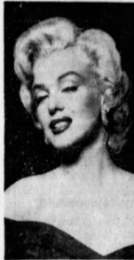
MARILYN MONROE ... again, a favorite

Stanley Kramer was named the best director of the year for "Judgment at Nuremberg."