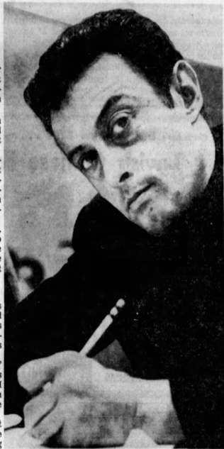
'SICK' COMEDIAN LENNY BRUCE ... at court in his Nehru-type coat

Lenny Bruce was cited for contempt in municipal court yesterday as his trial for using obscene language in a public place got under way.