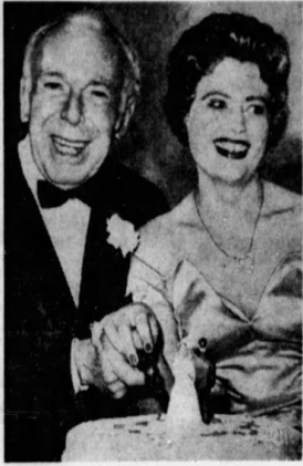
MANVILLE AND HIS STELLAR WIFE

NEW YORK, March 6. — (UPI) — Asbestos king Tommy Manville said today his 11th wife is no Elizabeth Taylor but is sufficiently endowed to become a film star.