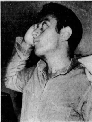
LENNY BRUCE CELEBRATED VERDICT ... he had just heard jury clear him