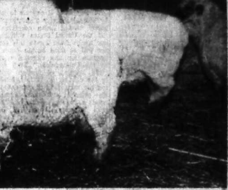
Spring, are being used as the flock tended by the sheep in the annual scene displayed in front of the church. So far they haven't miscalculated, but have repeated their lines perfectly.—Harris.