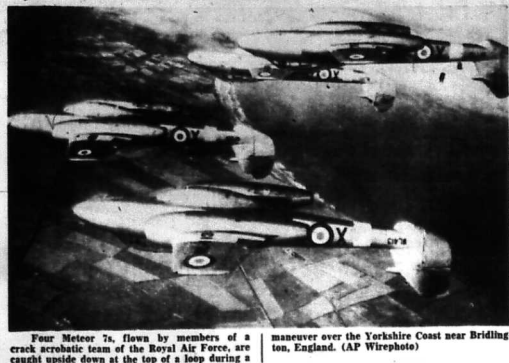
Four Meteor 7s, flown by members of a crack aerobatic team of the Royal Air Force, are caught upside down at the top of a loop during a maneuver over the Yorkshire Coast near Bridlington, England. (AP Wirephoto)