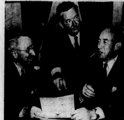
Governor Adlai Stevenson (right), Democratic Presidential nominee, and his running mate, Senator John Sparkman (center), are pictured here as they conferred with President Truman in his White House office yesterday.