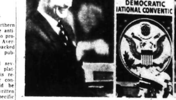
Gov. Adlai Stevenson, shown in three poses above as he talked and gestured at the opening session of the Democratic National Convention in Chicago, is rapidly becoming the No. 1 man with the delegates despite his protestations that he wants only to be Governor of Illinois.

CONVENTION HALL, CHICAGO (AP)—Angered Southerners today against a "loyalty" pledge adopted by the Democratic convention and challenging the Truman-Fair Deal Democrats to throw them out of the party's councils.