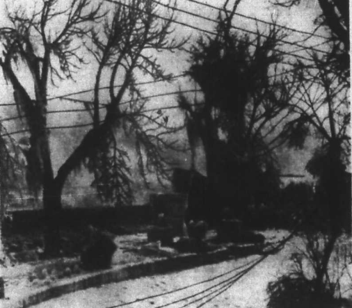
Wind-driven sprays from Lake Michigan point icy, but not rosy, pictures in Chicago as winter changes the city's landscape. Peterson is replacing links which snapped from weight of ice which formed on them.