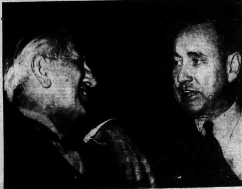
With Democrats from all over the state crowding the Veepe Hotel lobby yesterday afternoon to greet Vice-President Barkley, it was almost like a convention-time at Raleigh's Sir Walter