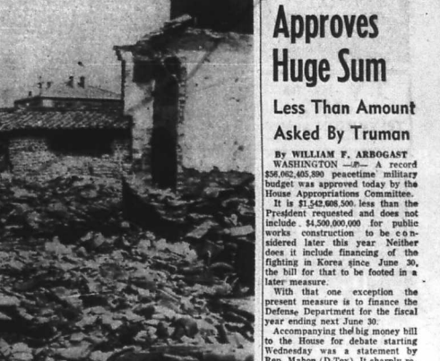
Two Korean children climb through the rubble of blasted buildings in Seoul searching for survivors. The capital city is 55 miles from Kaesong, site of peace negotiations.